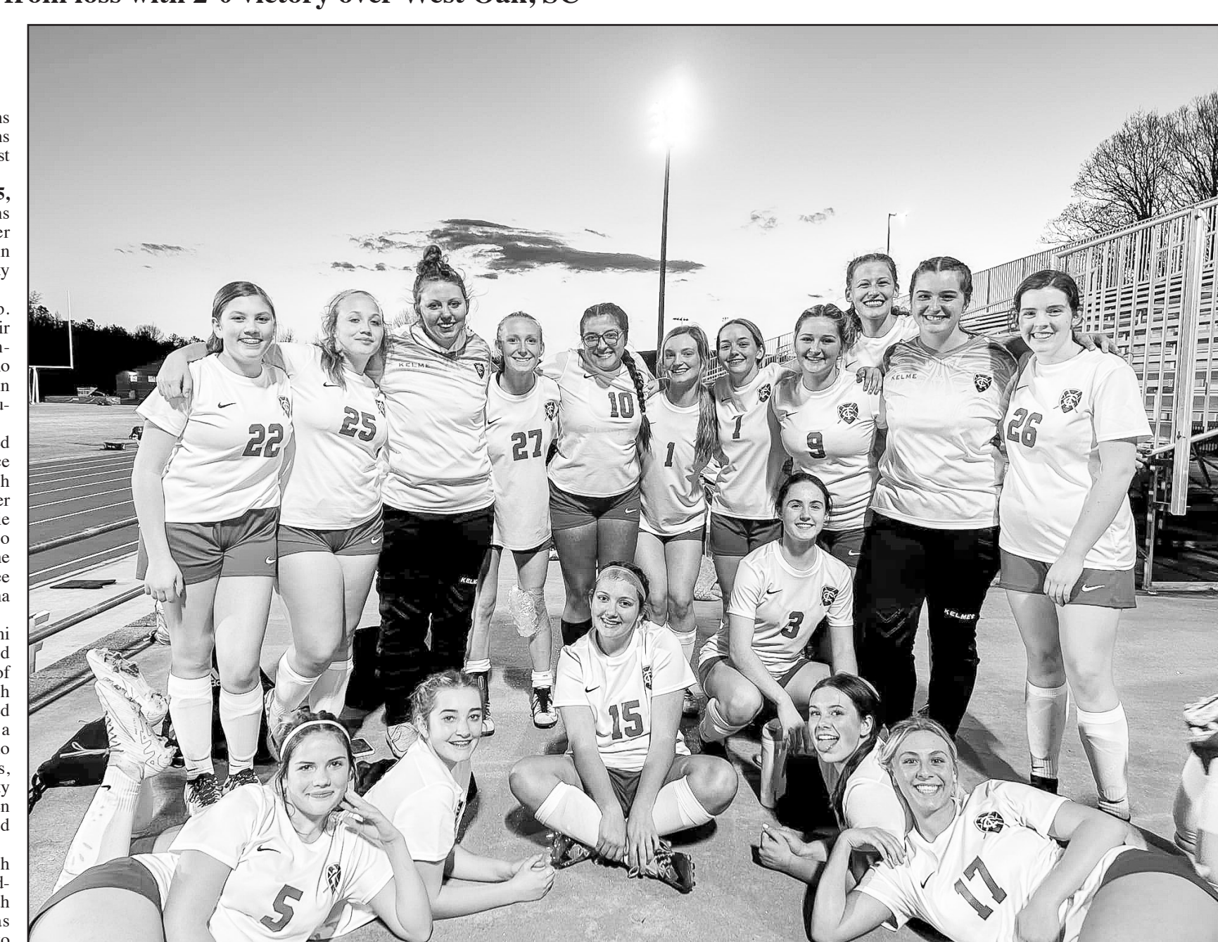
The Towns County Lady Indians following last month's victory over Class AA Banks County.

The Indians will face their next opponent in Greene County on Wednesday, March